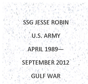
Example 8 x 8 Brick Paver