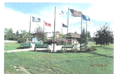
Example of Memorial Park

The tentative opening for the Township of Dorr's Veteran's Memorial will be Memorial Day 2016.